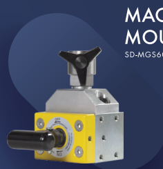
MAGNETIC MOUNT SD-MGS600-SM-KIT