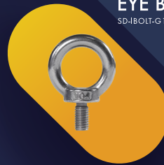
EYE BOLT SD-IBOLT-G1