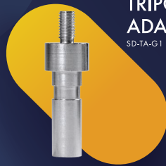
TRIPOD ADAPTER SD-TA-G1