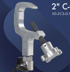
2" C-CLAMP SD-2CS-G1

Visit SeeDevil.com for a comprehensive list