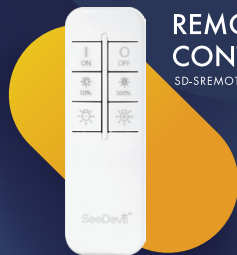
REMOTE CONTROL SD-SREMOTE-G2