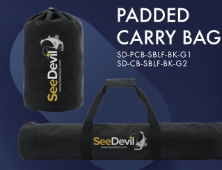
PADDED CARRY BAGS SD-PCB-SBLF-BK-G1 SD-CB-SBLF-BK-G2