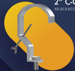
2" C-CLAMP SD-2CS-ECON-G1

+ LED Balloon Light Fixture Carry Bag SD-CB-SBLF-BK-G1