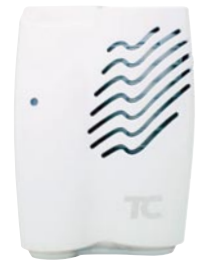
750180 Fan Dispenser

Preference Pack 402236 1(5) 0.11 2.0 lbs. (Contains one refill each of Wakening Spring, Polar Mist, Blue Splash, Citrus and Crystal Breeze)