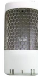
402430 Heavy Duty Dispenser