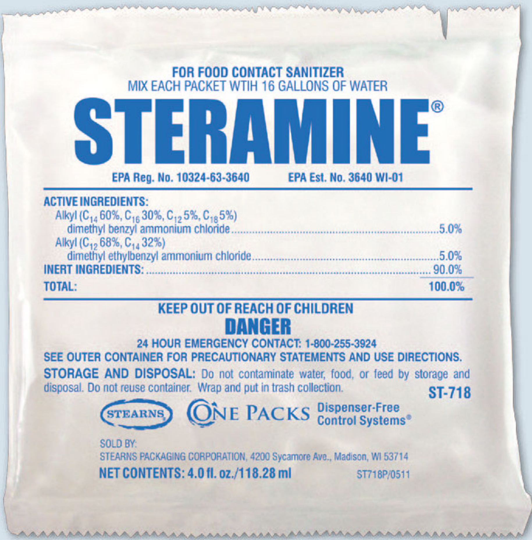
Steramine® ST-718, 4 fl. oz. pack

In hospitals, use Steramine® for the general disinfection of floors, walls, countertops, bathing areas, lavatories, tables, chairs, garbage pails and other hard non-porous surfaces. Apply Steramine® with cloth, mop or mechanical spray device. Be sure to follow label directions and dilute to the proper strength for the application. To be certain you are getting the right strength for the job, Stearns recommends checking the use solution with quaternary test strips.