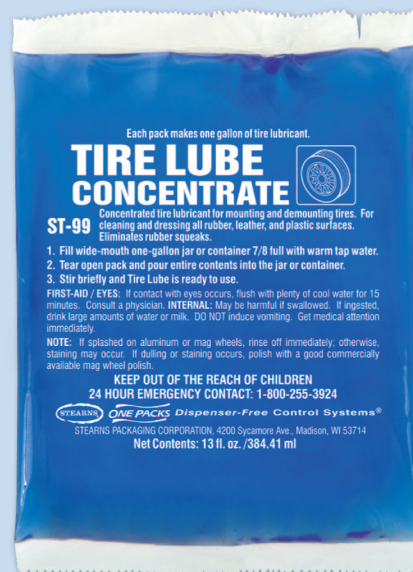
Stearns Tire Lube Concentrate ST-99, 13-ounce pack