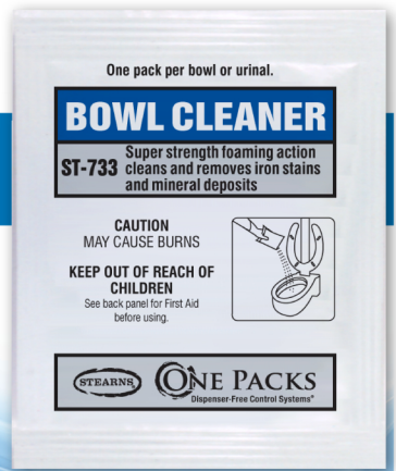
Bowl Cleaner ST-733, 1 oz. pack

Acid-Based Toilet Bowl Cleaner Super-strength foaming action cleans and removes iron stains and mineral deposits.