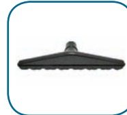
10-0032-C 14" Scalloped Floor Tool