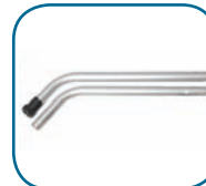
10-0029 Aluminum 2-Piece Wand