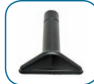
10-0031 5" Upholstery Tool