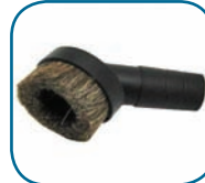
10-0037 3" Round Dust Brush