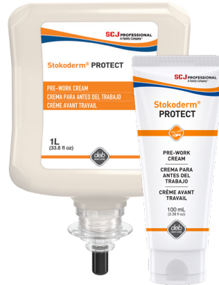
Application - General water and oil-based substances

NB: Where possible skin exposure to potentially harmful substances and environments should be avoided through the implementation of safe working practices and the use of appropriate Personal Protective Equipment. Where skin exposure cannot be avoided, it is recommended to use an appropriate skin defense cream as part of a complete skin care program to reduce the risk of occupational skin disease.