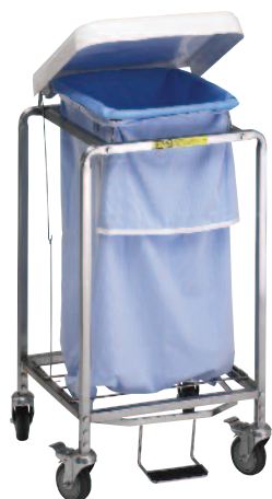
682 "Leakproof" Hamper w/ Foot Pedal