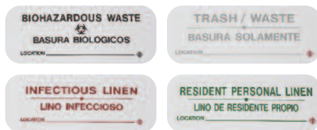
Label size (12" x 4")