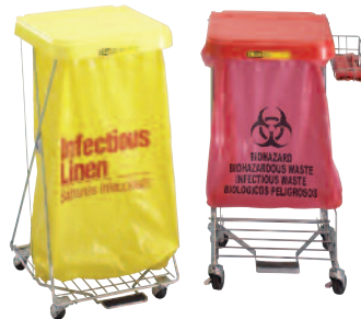
Infectious Liner & Biohazard Waste Poly Liners