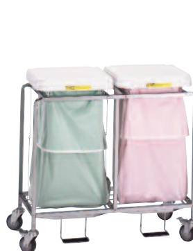
684 "Leakproof" Hamper w/ Foot Pedal

All deluxe hampers are constructed from 7/8" tubular steel with a sturdy chrome finish. All units ship knocked-down for an outstanding freight value.