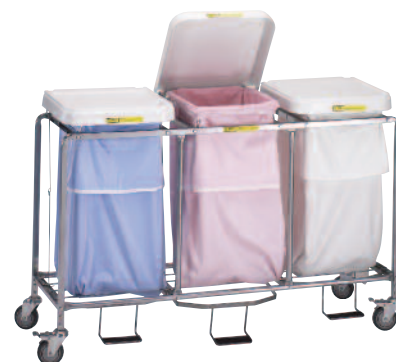
686 "Leakproof" Hamper w/ Foot Pedal