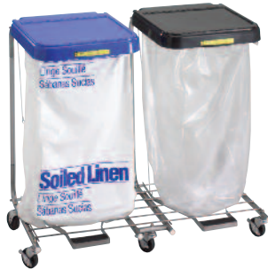
Soiled Liner & Non Specific Poly Liners