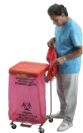
692 w/ 692BH