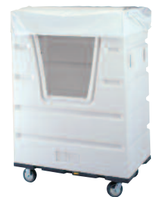
Bulk Transport Truck