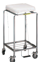
682NB Deluxe Hamper w/ Out Bag, Includes Bag Lock & Foot Pedal