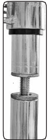
Fully Threaded Stud Connector