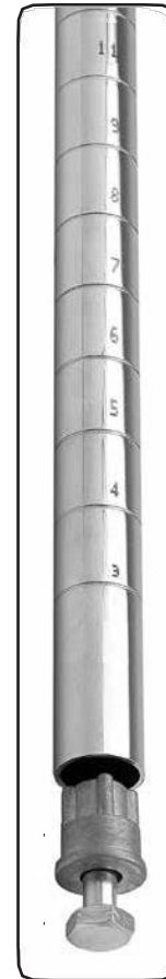
Post Insert Post Leveling Bolt