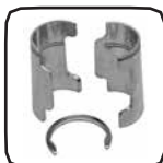
Aluminum Split Sleeve