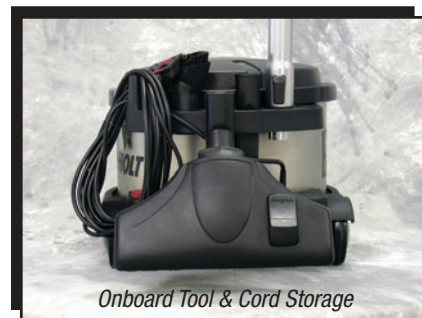
Onboard Tool & Cord Storage