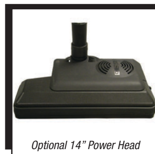
Optional 14" Power Head