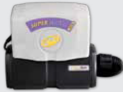
Super HalfVac HEPA