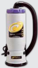
Super QuarterVac HEPA