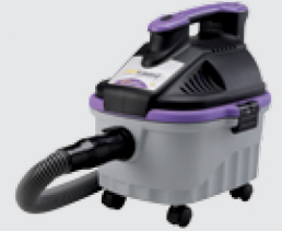
ProGuard 4 Portable Wet/Dry