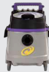
ProGuard 10 Wet/Dry