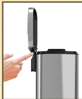
Lid Stay-Open Mode