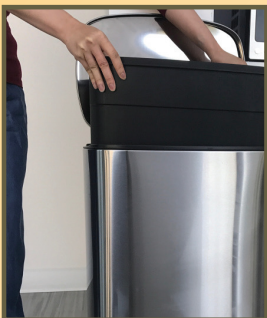
Removable Inner Bucket