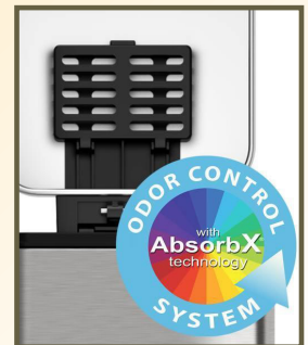
AbsorbX® Replaceable Odor Filter