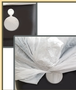
Tuck & Hold Bag Retention