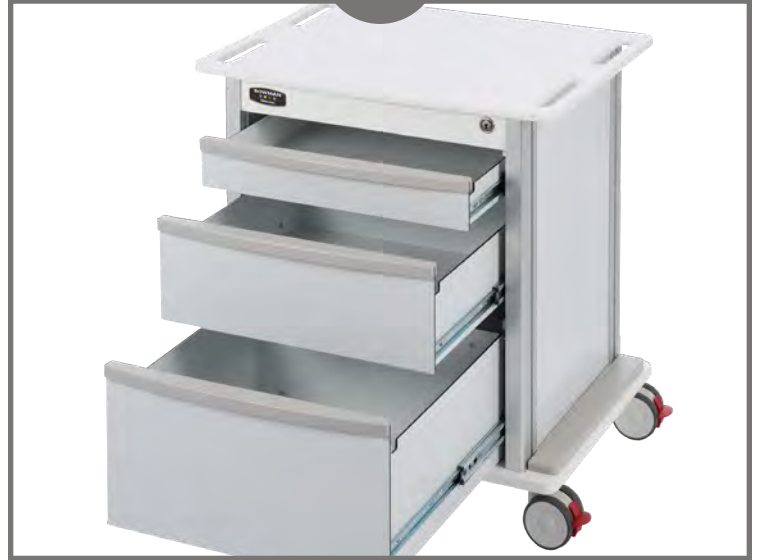
All drawers are locked and unlocked with one key. Varied depths of drawers for most effective storage options.