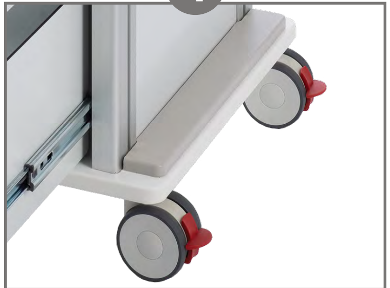
Two easy toe lock and unlock casters to immobilize cart for use.