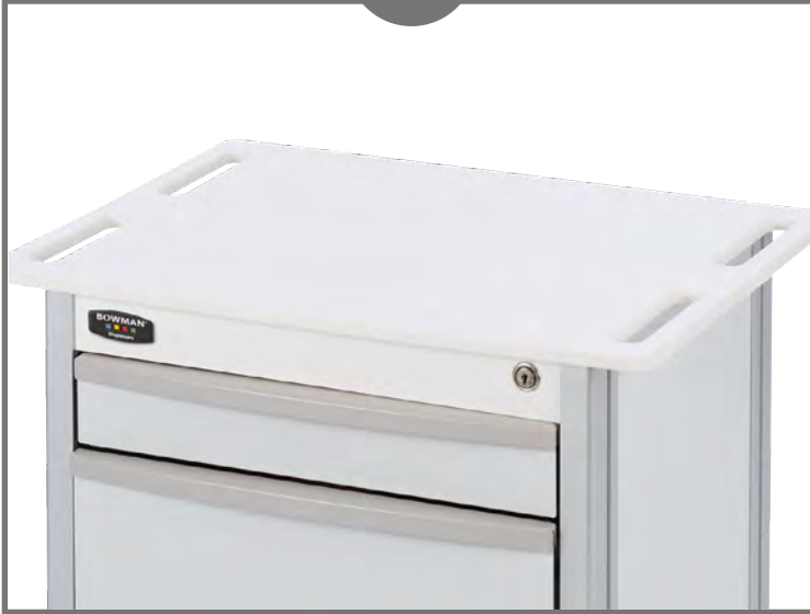
Built-in positioning handles on both sides.