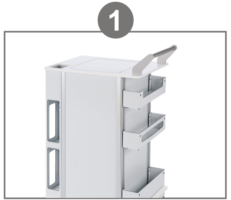
Elevated handle provides a better option for taller users.