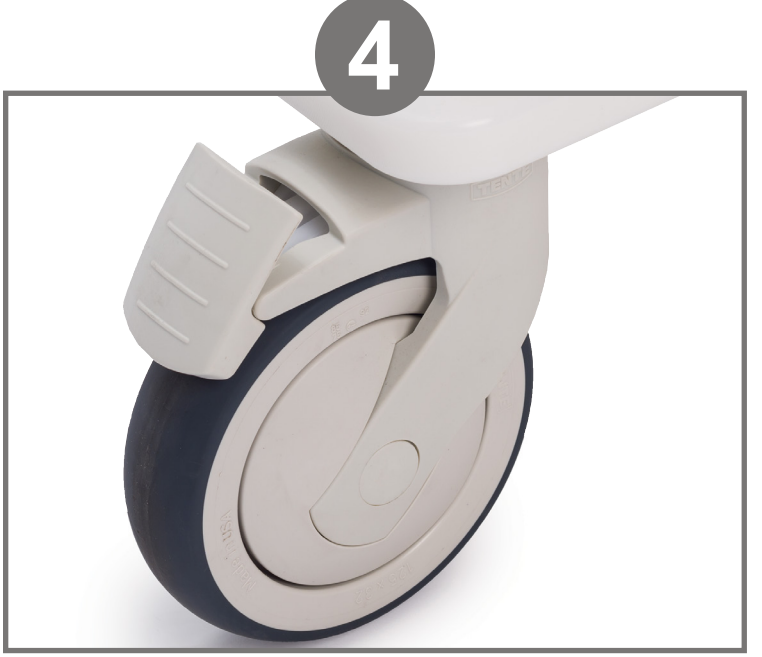
Two easy toe lock and unlock casters to immobilize cart for use.