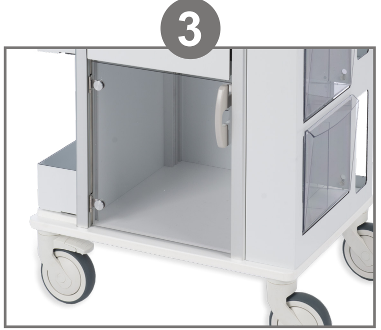
Large, locking, doored area provides additional storage for larger items.