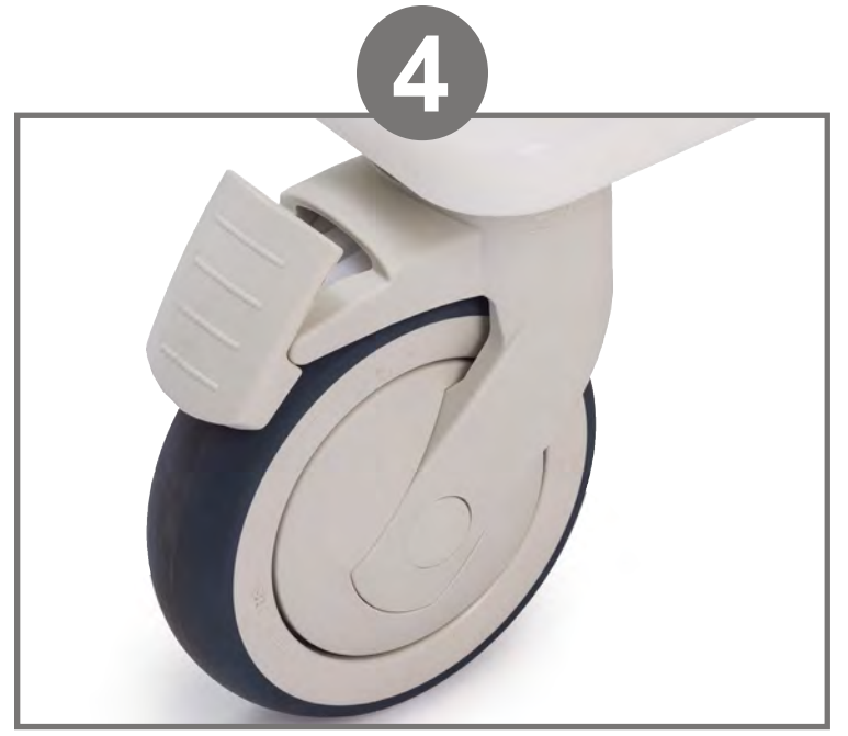
Two easy toe lock and unlock casters to immobilize cart for use.