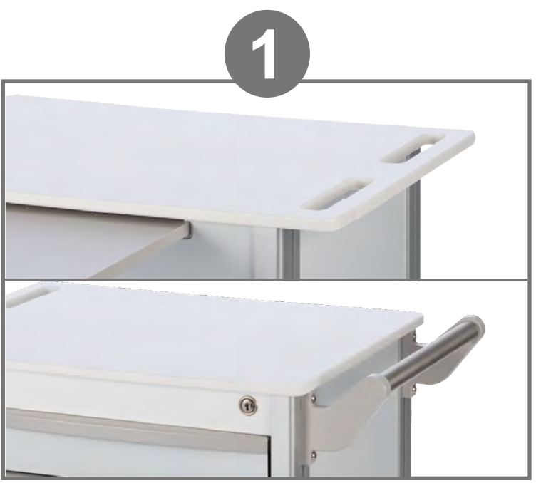
Built-in positioning handle and exterior travel handle.