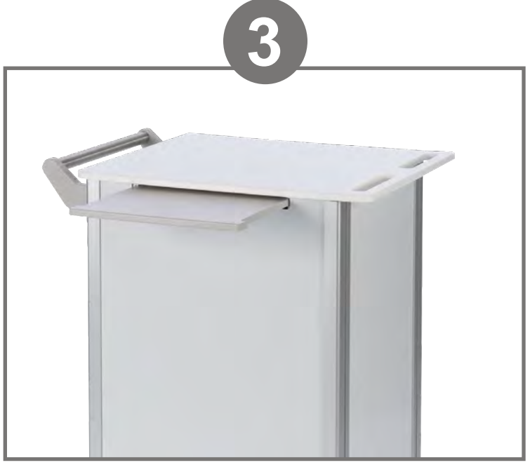
Convenient pull-out supplementary surface to expand work area.