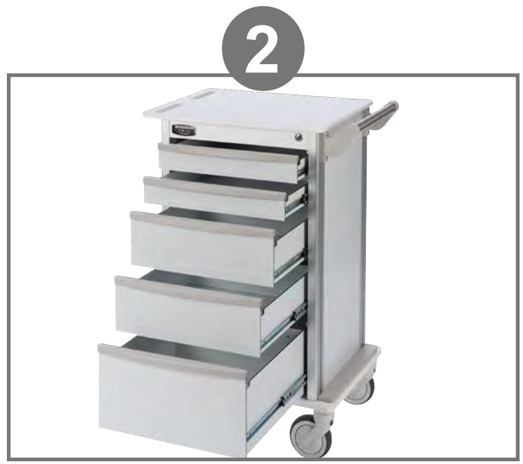
All drawers are locked and unlocked with one key. Varied sizes in drawers for most effective storage options.