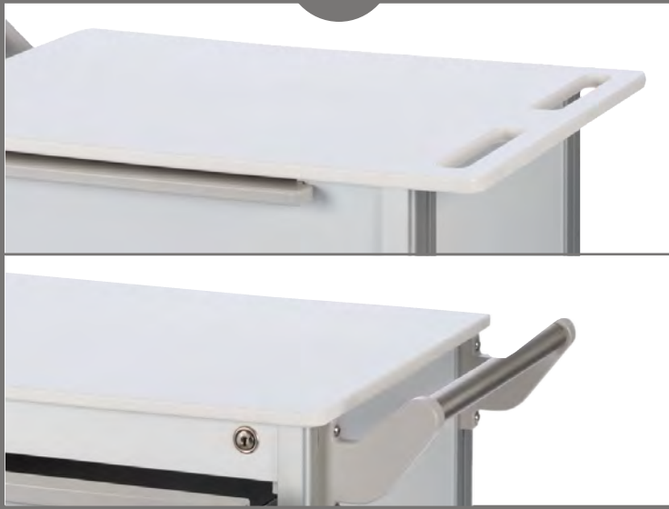
Built-in positioning handle and exterior travel handle.