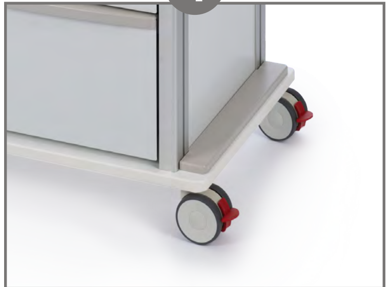
Two easy toe lock and unlock casters to immobilize cart for use.