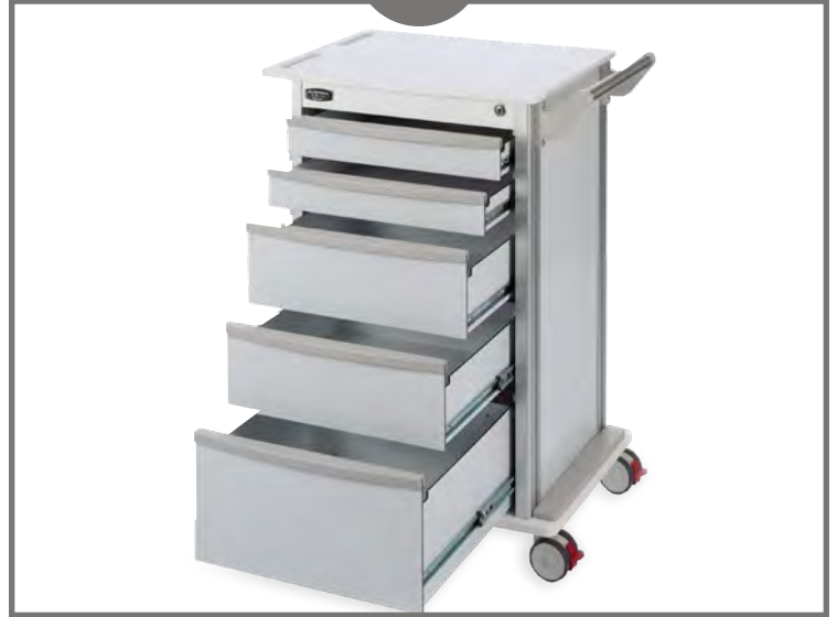
All drawers are locked and unlocked with one key. Varied sizes in drawers for most effective storage options.