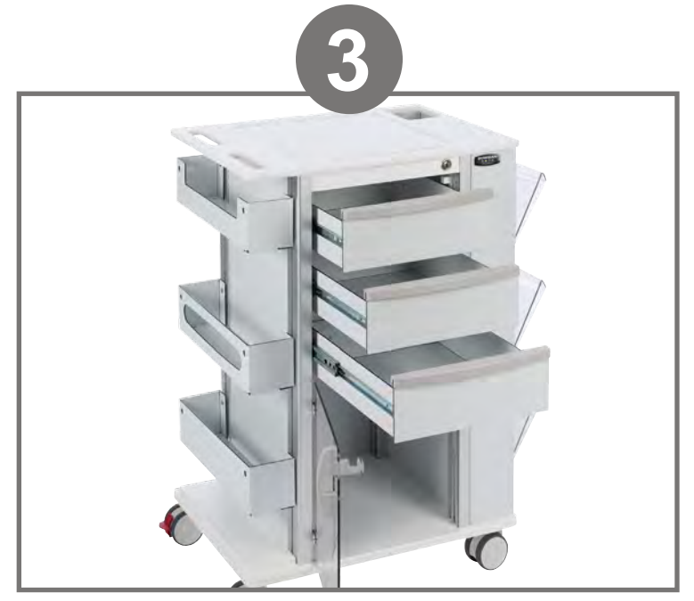
All drawers are locked and unlocked with one key. Clear door has integrated locking system with drawers so all are locked at once.