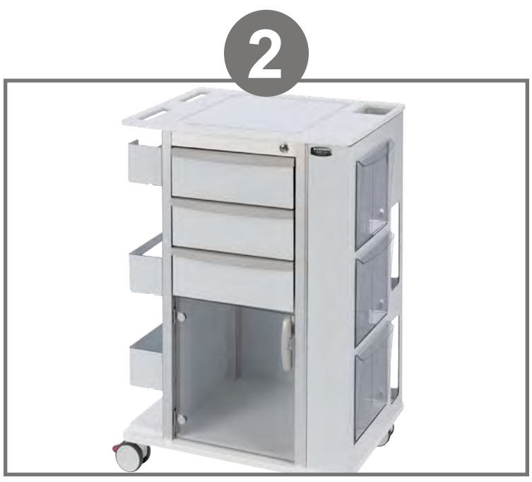
Side bins tilt for quick and easy access.