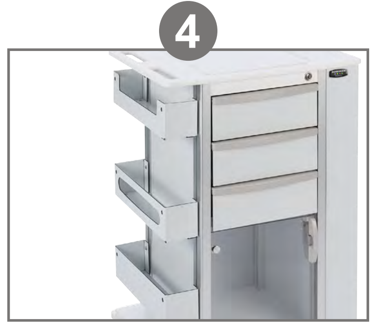
Rail system allows for position adjustment and addition of storage components.