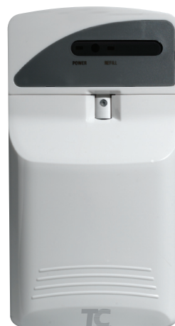
TC Pump LED 400695