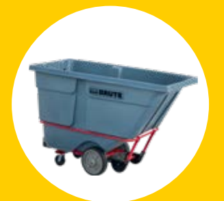
2023 BRUTE ROTOMOLDED TILT TRUCKS