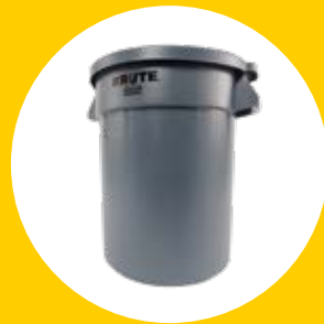
1968 BRUTE® TRASH CAN