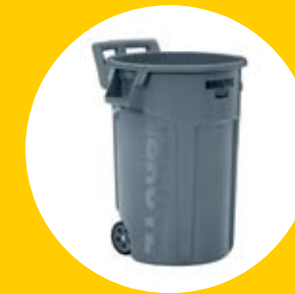
2021 WHEELED BRUTE®