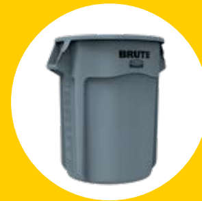
2007 VENTED BRUTE®