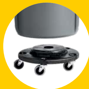
1987 BRUTE® DOLLY