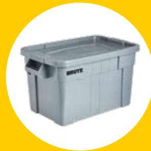
2002 BRUTE® TOTE