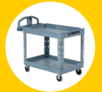
2023 BRUTE HEAVY-DUTY ERGONOMIC UTILITY CARTS