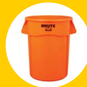
2020 HIGH VISIBILITY BRUTE®