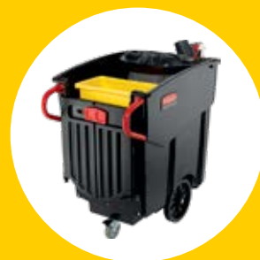
2006 MEGA BRUTE®