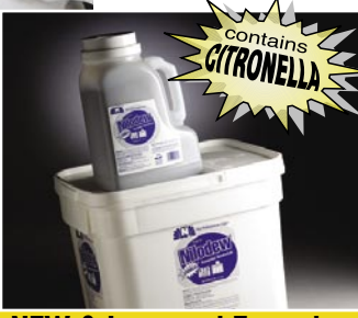
NEW & Improved Formula

Nilodew is a clay and Zeolite based granular deodorizer that contains a natural odor absorbent, our proprietary odor neutralizer to fight odors and Citronella to deter flies and other pests. Used to control odors in dumpsters, compactors, ash trays, waste baskets, etc., for up to seven days.