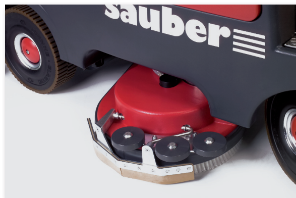
RA900 Sauber Scrubber shown

The Sauber easily glides through (30"/34") doorways, has a super tight turning radius, and is 50% faster than a walk-behind scrubber. Low to the floor and robust, the Sauber is easy to board, safe to use and comfortable to operate.