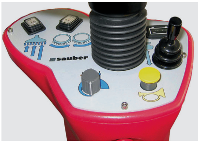
Easy to use, adjustable control panel