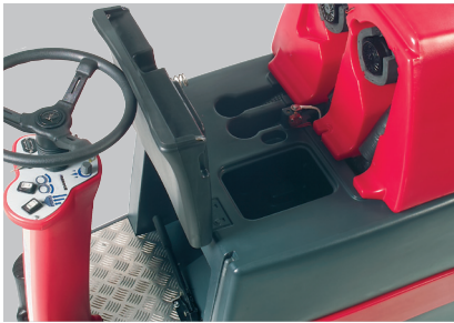
Convenient under seat access