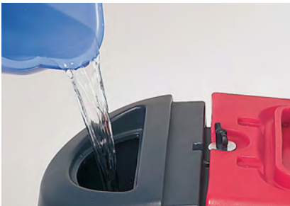
Wide Filling Inlet