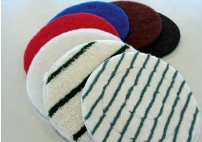
Optional High Speed Polishing Pads