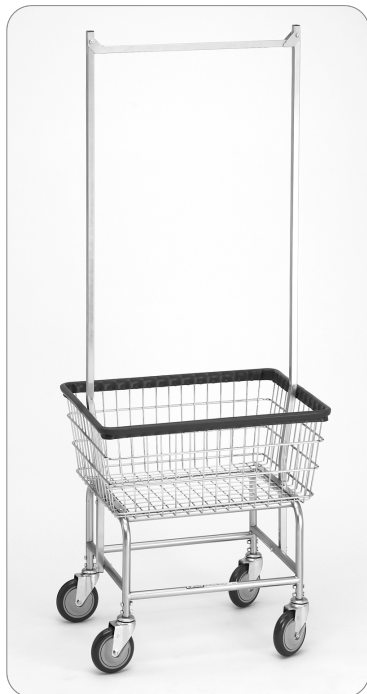
100E58, 96B58, 200F56, 300G55