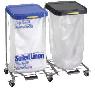
Soiled Linen & Non Specific Poly Liners