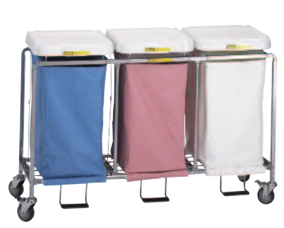
676 "Easy Access" Hamper w/ Foot Pedal