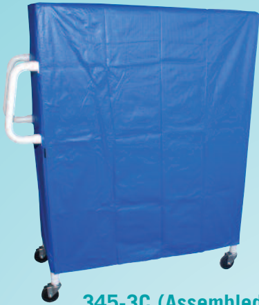
345-3C (Assembled with Cover) ALL CARTS COME FULLY ENCLOSED