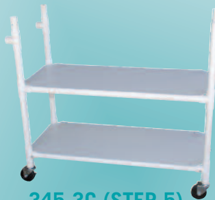
345-3C (STEP 5)