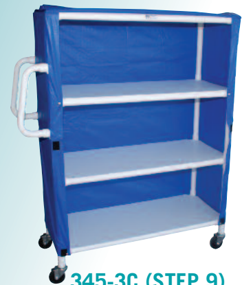
345-3C (STEP 9)