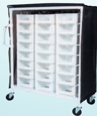
395-48 TOTAL CART W/48 BINS SHOWN W/MESH NAVY