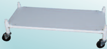
345-3C (STEP 2)