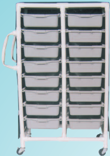
360-16T SPECIALTY CART