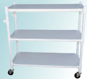
345-3C (STEP 6)