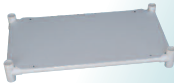
345-3C (STEP 1)