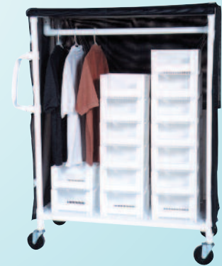
396-SB STACKING BINS FOR TOTAL CART