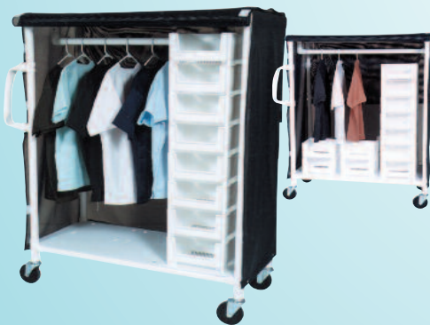
395-16 COMBO CART