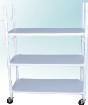
345-3C (STEP 7)