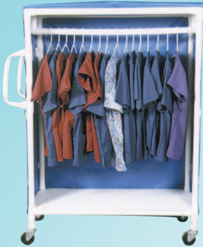
345-1C SHOWN W/SOLID BLUE