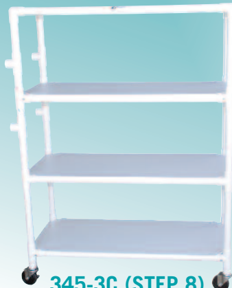
345-3C (STEP 8)